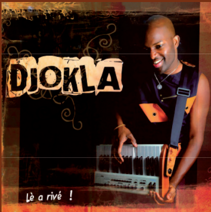
« Lé à rivé » Maxi