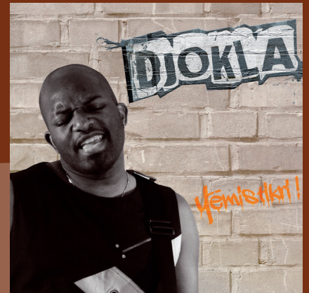
« Yémistikri » Single