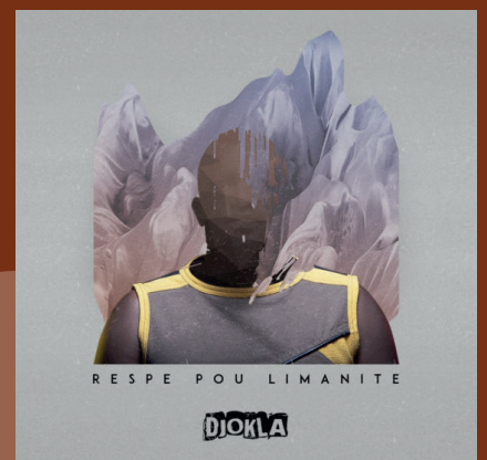
« Respé pou Limanité » Single