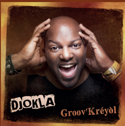
« Groov' Kréyòl » Album